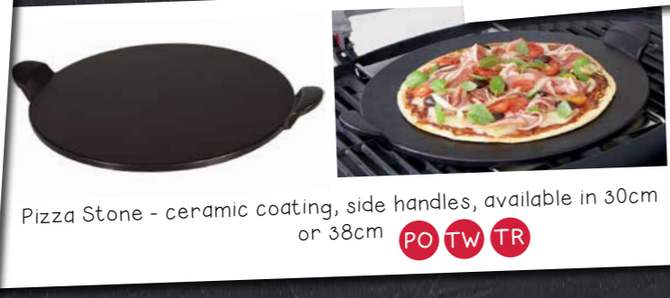
Pizza Stone - ceramic coating, side handles, available in 30cm or 38cm PO TW TR