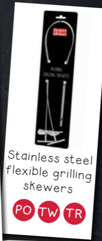
Stainless steel flexible grilling skewers PO TW TR