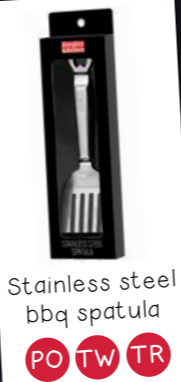
Stainless steel bbq spatula PO TW TR