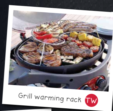
Grill warming rack TW