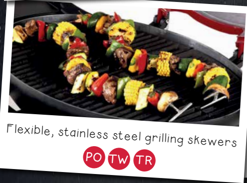
Flexible, stainless steel grilling skewers PO TW TR