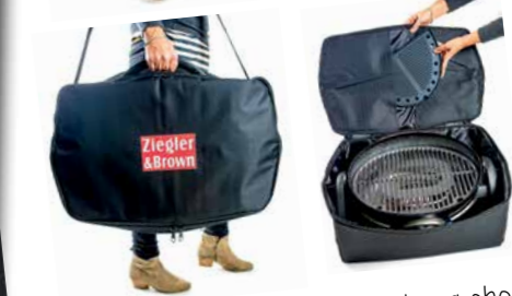
The optional Carry bag includes a shoulder strap or use the BBQ hood handle to carry your Ziggy. Comes with handy storage pockets for extra accessories.