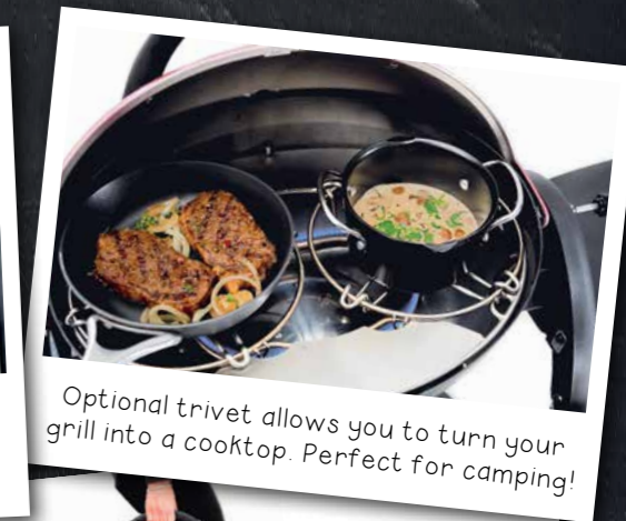
Optional trivet allows you to turn your grill into a cooktop. Perfect for camping!