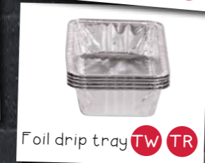
Foil drip tray TW TR