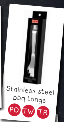
Stainless steel bbq tongs PO TW TR