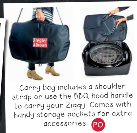
Carry bag includes a shoulder strap or use the BBQ hood handle to carry your Ziggy. Comes with handy storage pockets for extra accessories. PO