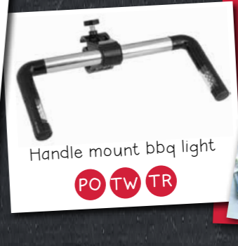
Handle mount bbq light PO TW TR