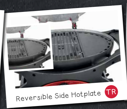
Reversible Side Hotplate TR