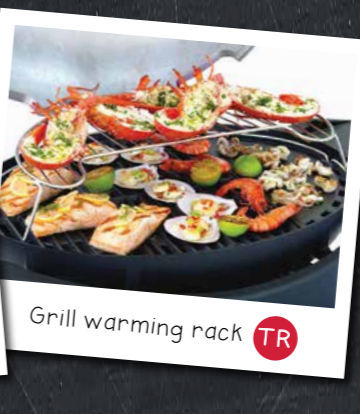
Grill warming rack TR