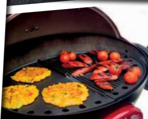
Reversible half hotplate PO