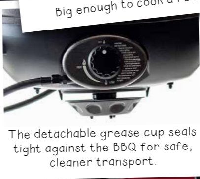
The detachable grease cup seals tight against the BBQ for safe, cleaner transport.