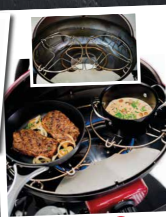
Trivet kit PO