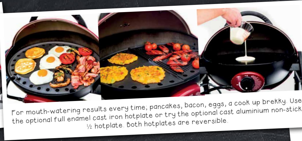
For mouth-watering results every time; pancakes, bacon, eggs, a cook up brekky. Use the optional full enamel cast iron hotplate or try the optional cast aluminium non-stick 1/2 hotplate. Both hotplates are reversible.