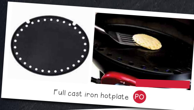
Full cast iron hotplate PO

Check out the full range of Ziegler & Brown accessories and optional cooking formats to make it the most versatile BBQ we know of. It will change the way you cook!