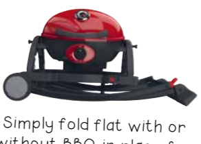
Simply fold flat with or without BBQ in place for easy transport and storage.