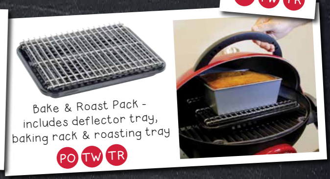
Bake & Roast Pack - includes deflector tray, baking rack & roasting tray PO TW TR