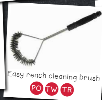
Easy reach cleaning brush PO TW TR