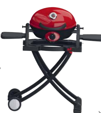
This handy cart comes with integral storage space for your optional accessories. It also has the capacity to hold 4-9kg gas cylinders.