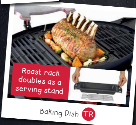
Roast rack doubles as a serving stand