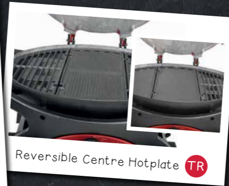
Reversible Centre Hotplate TR