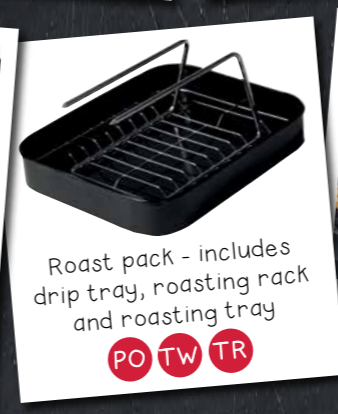
Roast pack - includes drip tray, roasting rack and roasting tray PO TW TR