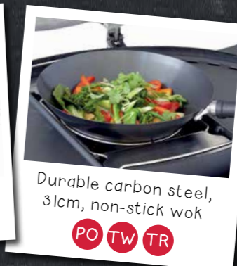
Durable carbon steel, 31cm, non-stick wok PO TW TR