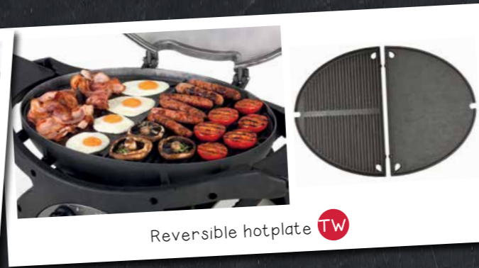
Reversible hotplate TW