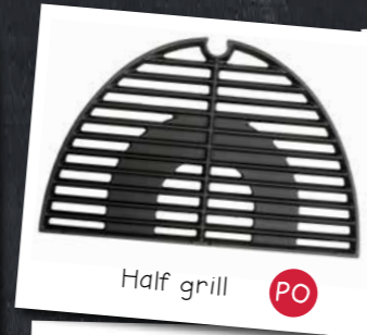
Half grill PO