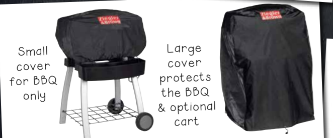
Small cover for BBQ only Large cover protects the BBQ & optional cart