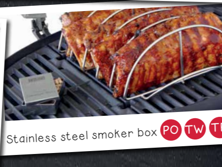
Stainless steel smoker box PO TW TR