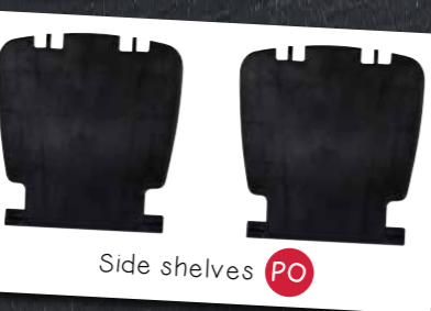
Side shelves PO