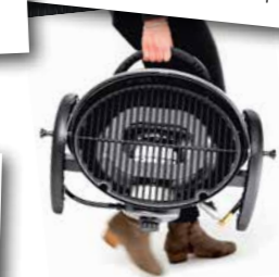
Ultra portable... The roll back hood locks into place.