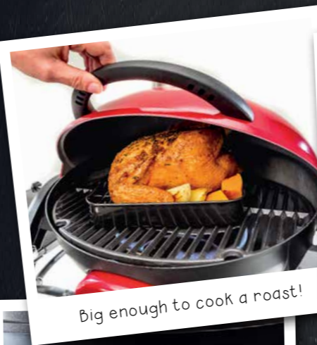
Big enough to cook a roast!

Pop it in the boot or on the back seat. Take it camping, to the beach, on picnics, use it on the balcony or BBQ beside the pool. It's great for big spaces, small places, flats, home units or apartments.