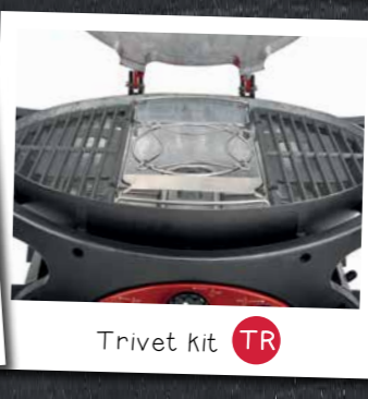
Trivet kit TR