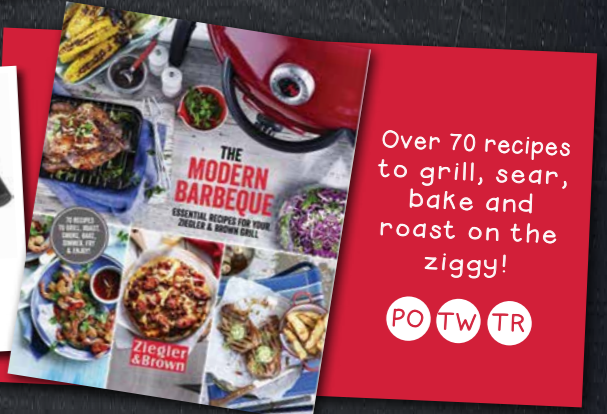
Over 70 recipes to grill, sear, bake and roast on the ziggy!