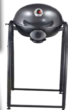
This stand is compact, easy to carry, assemble, transport and store.