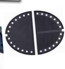
Trivet kit TW